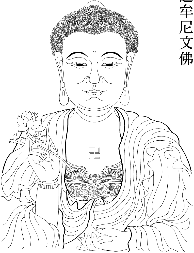
Namo Original Teacher Shakyamuni Buddha